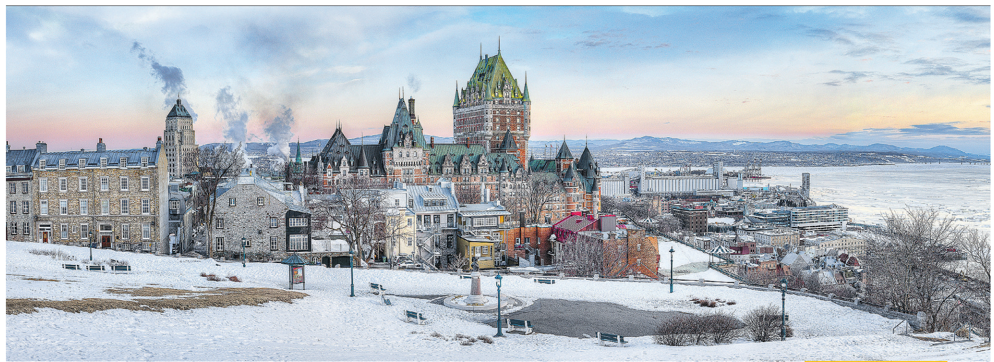
Fairmont Le Château Frontenac will hold dozens of anniversary celebrations through 2018, from the cutting of a giant birthday cake to themed dinners.